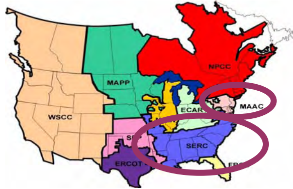
Figure 1 – Power Pools