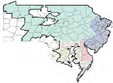
Mid-Atlantic Area Council (MAAC) Regional Power Pool