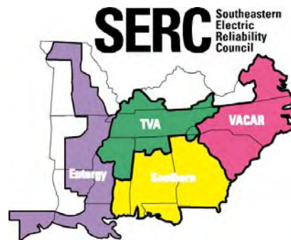
Southeastern Electric Reliability Council (SERC) Regional Power Pool